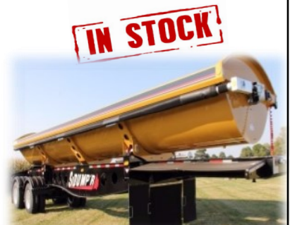
SIDUMP'R SIDE DUMP TRAILER