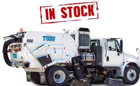
TYMCO 600 SWEEPER